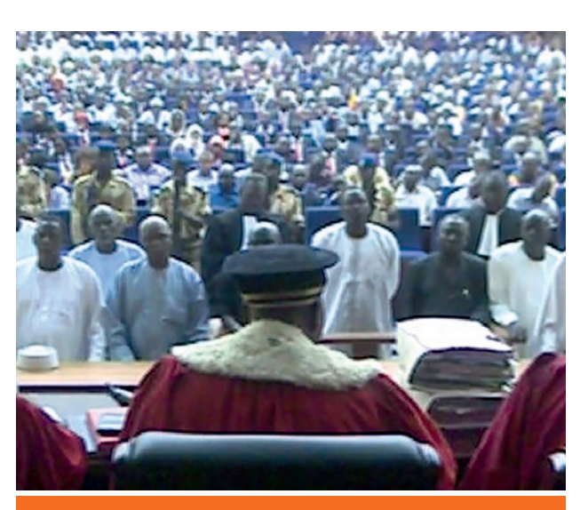
Trial of DDS agents in Chad 2015

In 2000, after filing the case against Habré in Dakar, the victims' association took the courageous action of filing criminal complaints against security officials from the