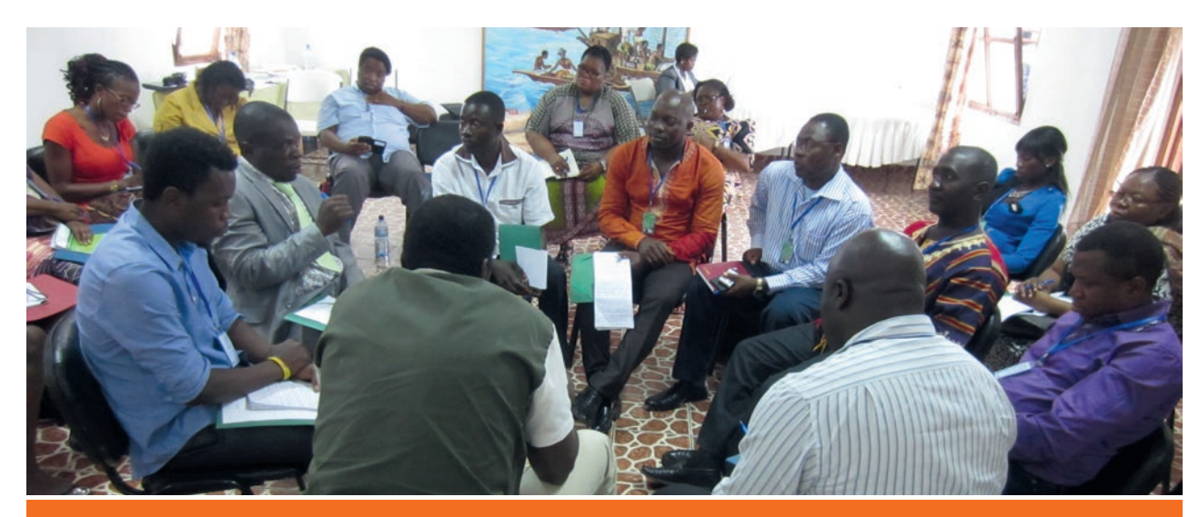
At a workshop in Cameroon representatives of partner organisations of Bread for the World practise the fish bowl exercise to discuss society's expectations of them as men and women and their vulnerability to HIV.

present-day adolescents. Participants are asked to close their eyes and remember the time when they were between 15 and 19 years old. The facilitator suggests that they think of their home, their school, their family and friends, their daily life, the thoughts that they had about themselves, their feelings and relationships and the conversations they had with others. All participants should immerse themselves in the past for a while. If they want, they can share their thoughts with the group afterwards.