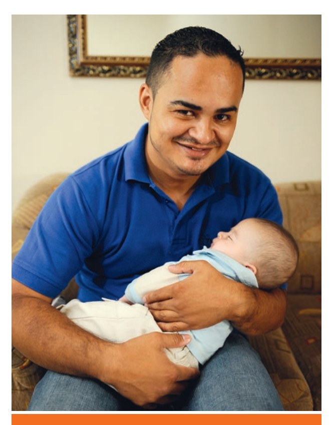
All over the world an increasing number of men are becoming involved in looking after their children.

This exercise also helps to make participants aware of their adolescent years, the emotional turmoil they might have experienced and thus it furthers better understanding of