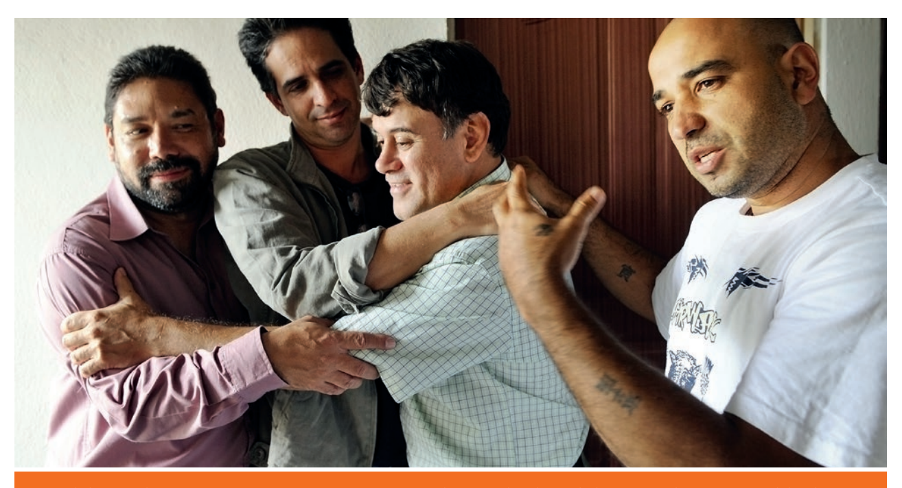
In workshops at the Instituto WEM in Costa Rica men are analysing male roles and identities in their society and developing new ways of communicating with each other and their families.

An increasing number of men want to change this situation by searching for transformative masculinities. It is, therefore, vital for men and boys to leave behind the oppressive notions of what it means to be a man. In their search for transformative masculinities men and boys can learn how to embrace more harmonious, respectful and tolerant ways of being men. As a result, they can change their understanding of who they are and how they relate to women, children and other men.