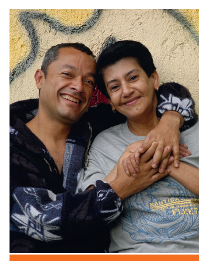
Acknowledging the diversity of sexual orientations is important in addressing and reducing vulnerability to HIV.

For people with sexual orientations that differ from the dominant heterosexual orientation, it is often extremely difficult to access information, to obtain good health care and to live according to their sexual orientation. Same-sex relationships are still criminalised in 76 countries worldwide. Such a situation makes it difficult for MSM to access HIV prevention and treatment services. Consequently, MSM and transgender people have a much higher risk of an HIV infection than heterosexuals. The vulnerability of a group increases when their rights are abrogated. For a man to bring a male partner to a clinic when he suffers from a sexually transmitted infec-