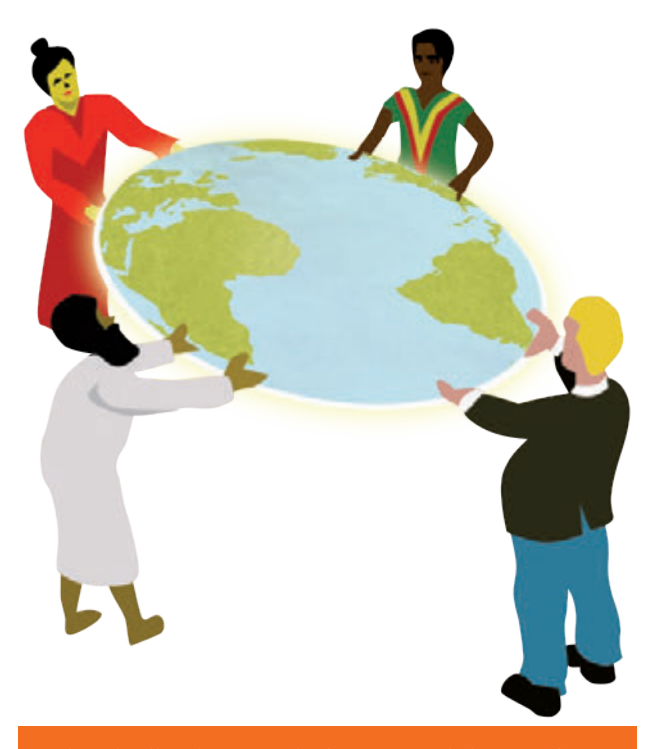
Political will and concerted efforts are needed to transform tourism.

Policy decisions must take all impacts into account in a comprehensive manner, not just economic impacts,